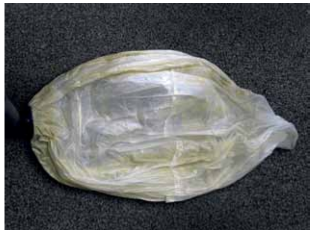
Minimum residue left in a discharged container.