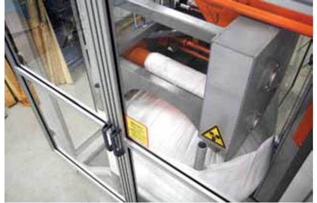
The PowerbagPress rolls the bag around its cylinder, creating a strong pressure that forces the product out of the bag.

Continuous, fully automated operation- limiting the need for supervision and minimizing product residue combine to give the user simple but cost effective product storage and handling.