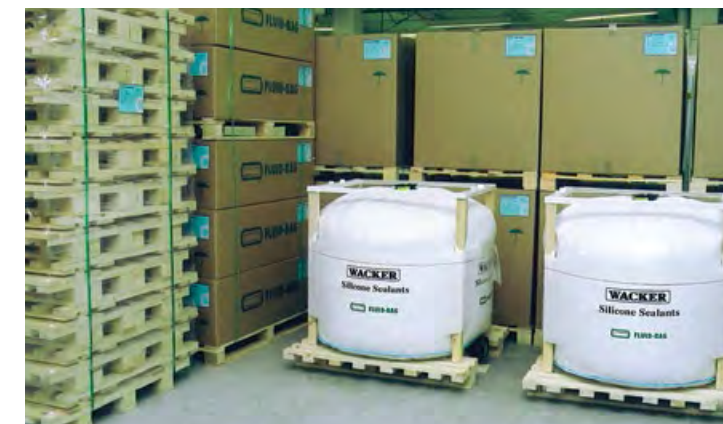
Wacker Chemie uses Fluid-Bags for their silicone products and has been a very important customer through the years.