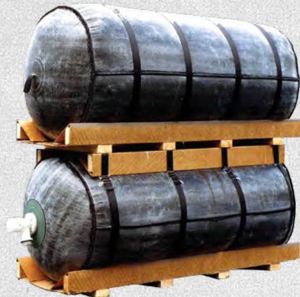
The very first version of the Fluid-Bag was a horizontal, longer container model.