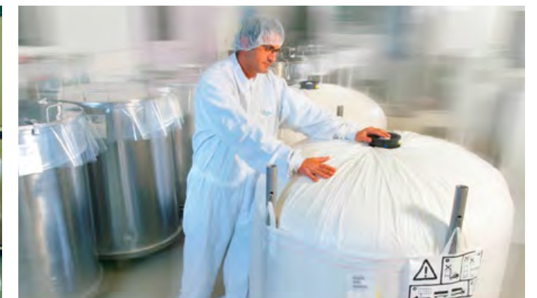
Fluid-Bags filled with Bayer HealthCare's Bepanthen ointment at GP Grenzach's production facilities.