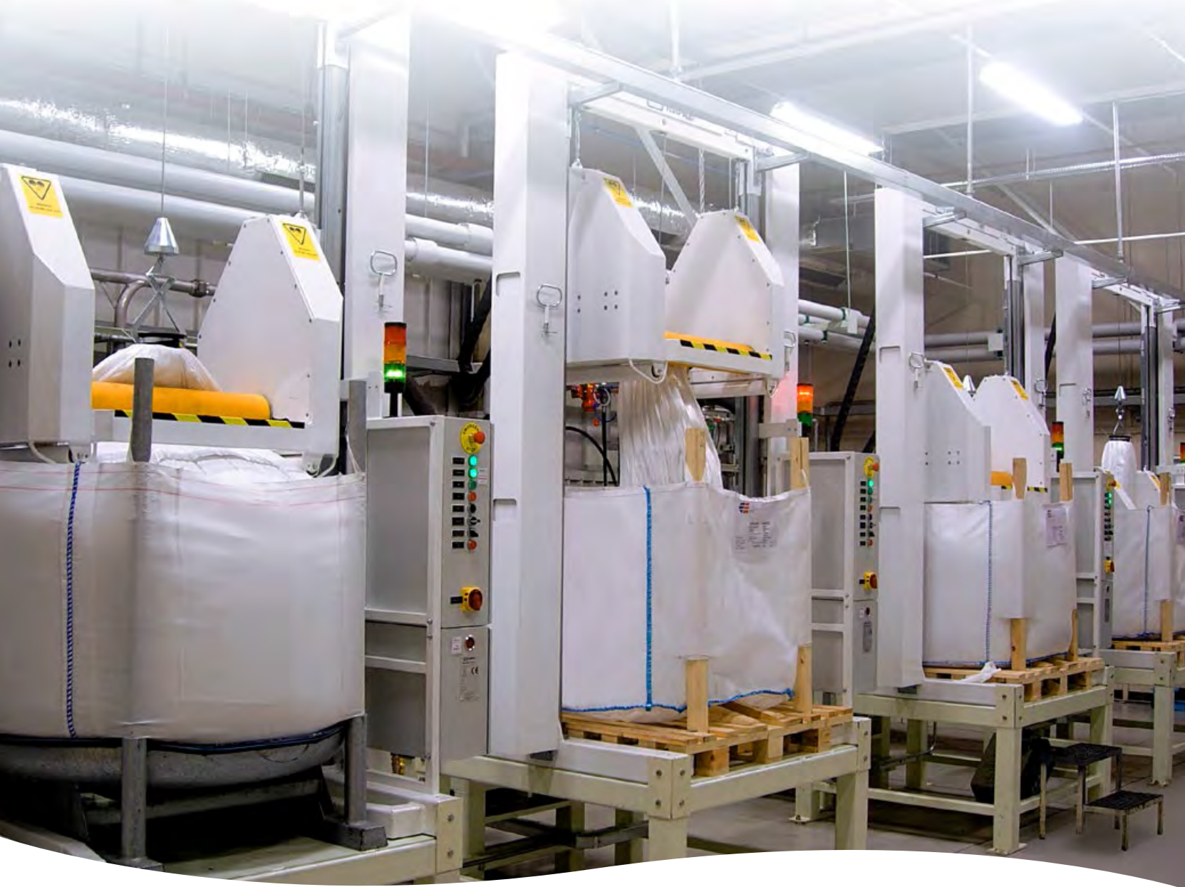
Toyota's manufacturing plant in Burnastone UK where Fluid-Bags are used for sound damping pastes for vehicles. Automated Fluid-Bag Discharge Rollers empty the bags and are connected directly to the vehicle production line.